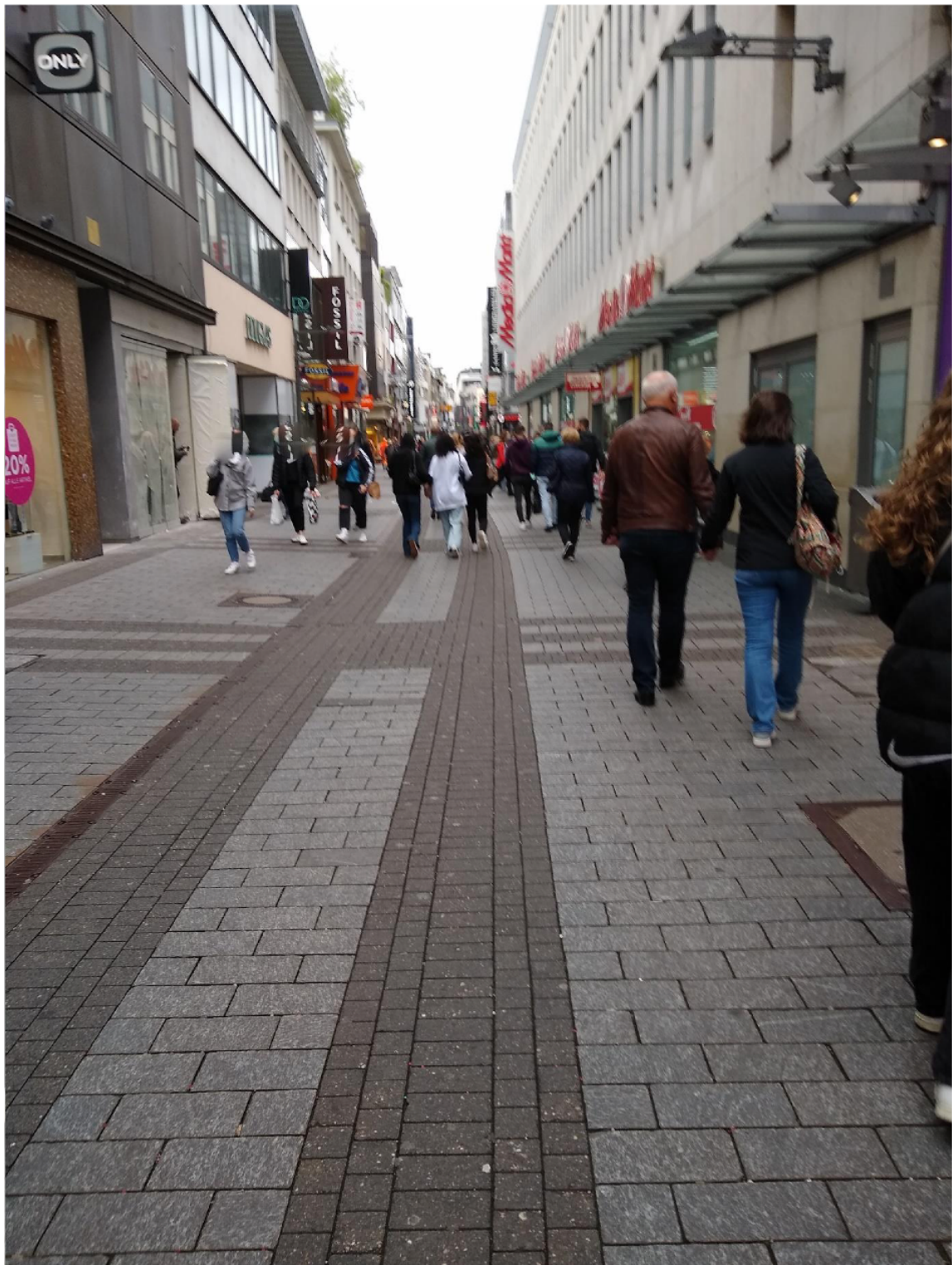
This picture is a little bit blurry, but I think you can still see how the shopping alley is structured.