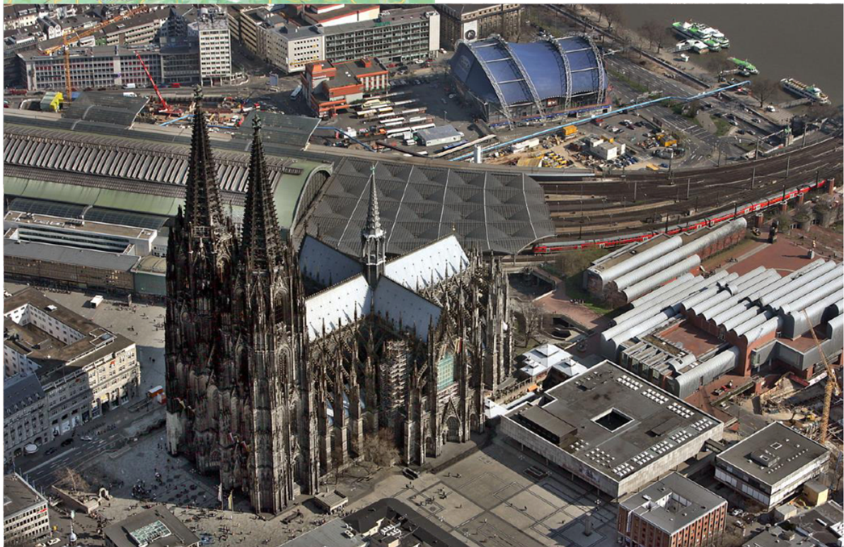
(The Kölner Dom)

It's the most often visited sight in Germany with 20.000 visitors a day.